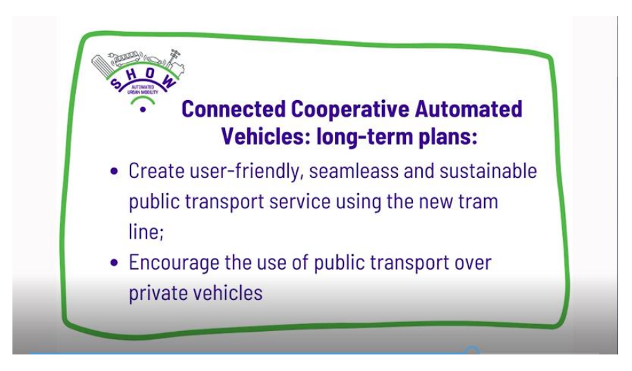
Figure 24: Interview with Tampere test site - Long-term plans for CCAV in Tampere