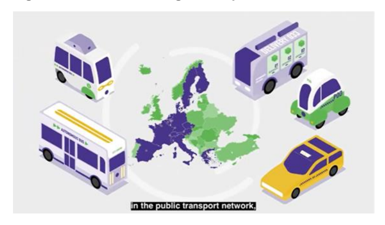
Figure 6: Shot showcasing different types of vehicles included in SHOW AVs fleets