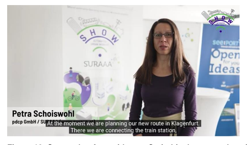
Figure 18: Screenshot from video on Carinthia demo - explanation of next phases