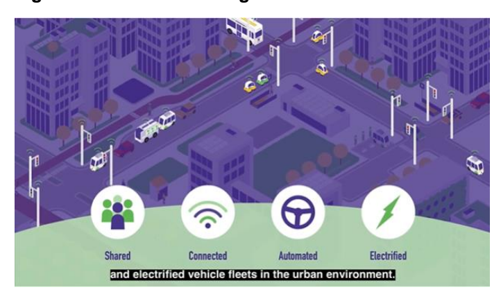
Figure 2: Show showcasing main characteristics of SHOW vehicles fleets