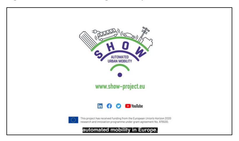
Figure 11: Final shot with EU funding disclaimer