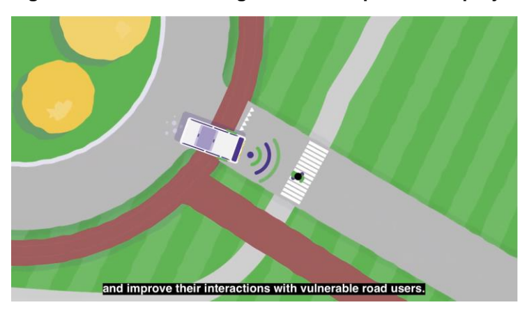
Figure 8: Shot showcasing interactions with vulnerable road user