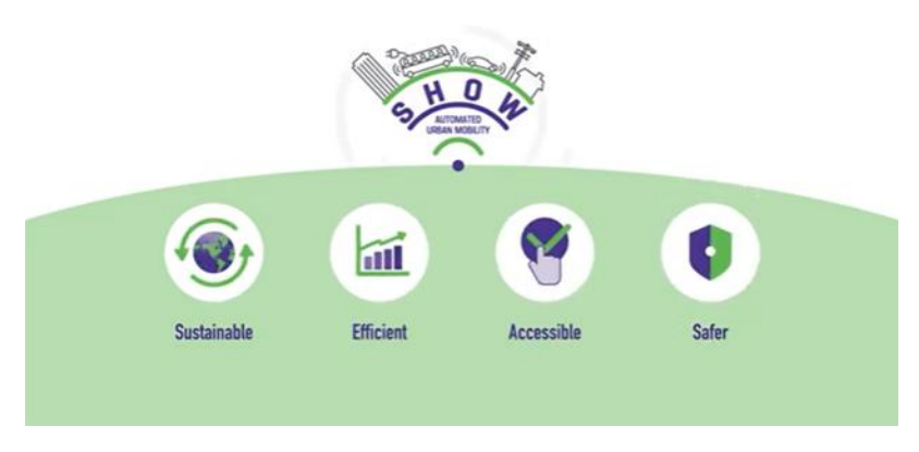
Figure 3: Shot showcasing benefits brought by SHOW mobility concept