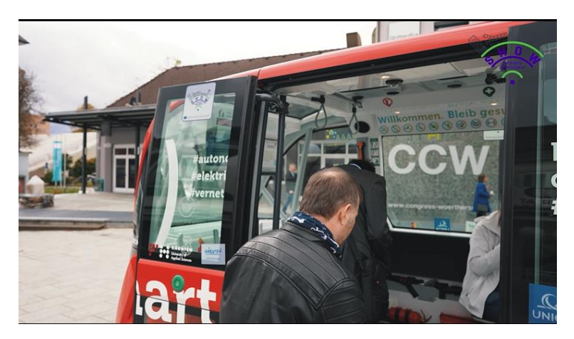
Figure 16: Screenshot from video on Carinthia demo - showcase of vehicles