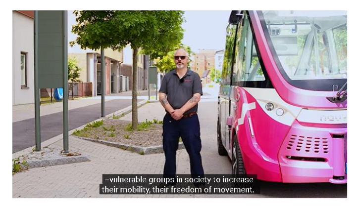
Figure 13: Screenshot from video on Linköping demo - showcase of the vehicle and of the use case