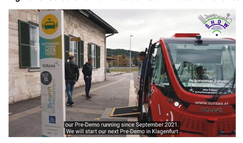
Figure 17: Screenshot from video on Carinthia demo - showcase of pre-demo activities