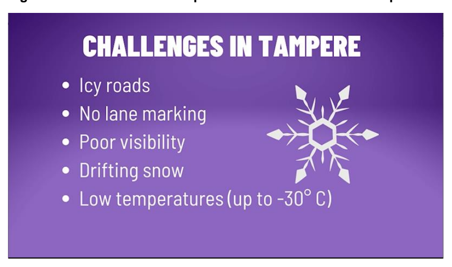
Figure 23: Interview with Tampere test site - Overview of the main challenges faced by the site