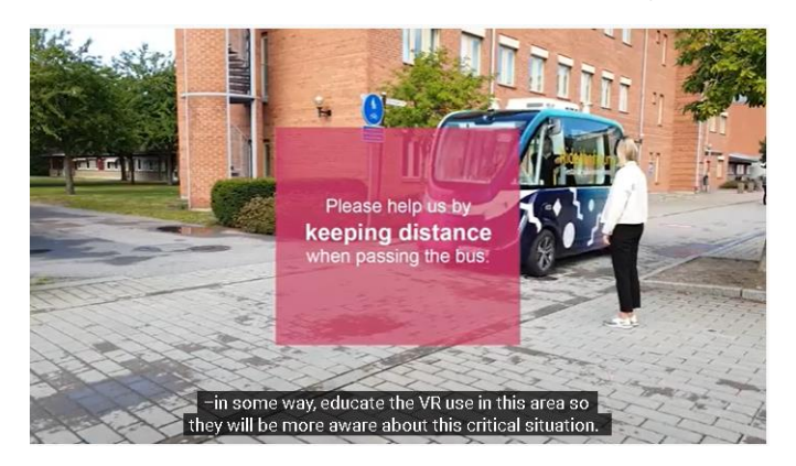
Figure 12: Screenshot from video on Linköping demo - interaction with VRU

Below it is possible to see some screenshots taken from the SHOW demo video focused on the demo site for automated shuttles in Linköping, Sweden (publicly available on SHOW YouTube channel here).