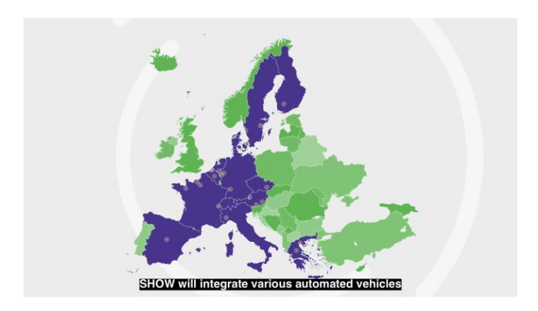
Figure 5: Shot showcasing SHOW pilot sites