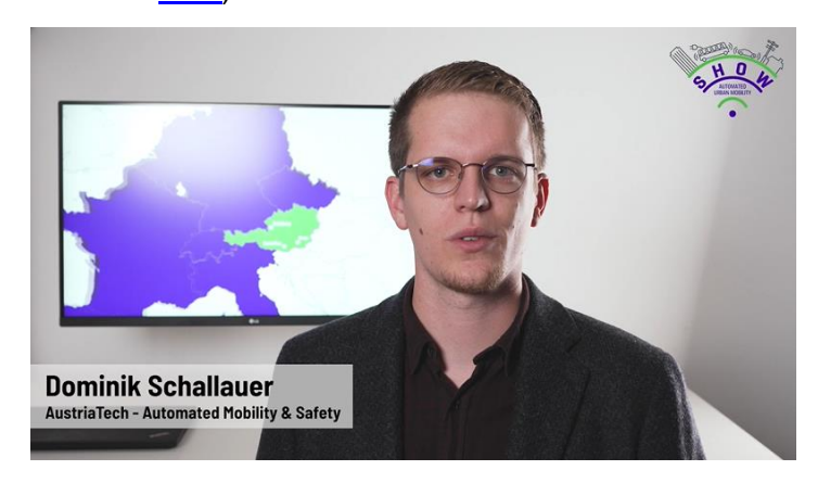
Figure 15: Screenshot from video on Carinthia demo - introduction to SHOW project

Below it is possible to see some screenshots taken from the SHOW demo video focused on the Carinthia test site in Austria (publicly available on SHOW YouTube Channel <a href="here">here</a>).