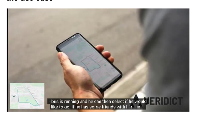
Figure 14: Screenshot from video on Linköping demo - showcase of users interface