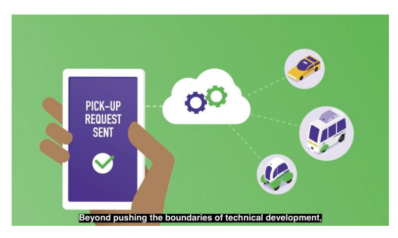
Figure 4: Shot showcasing how SHOW applies MaaS