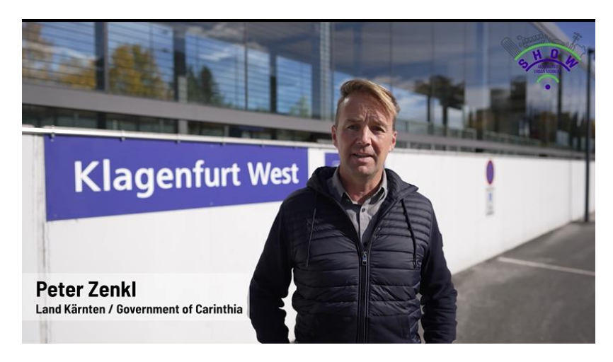
Figure 19: Screenshot from video on Carinthia demo - interaction with local authorities