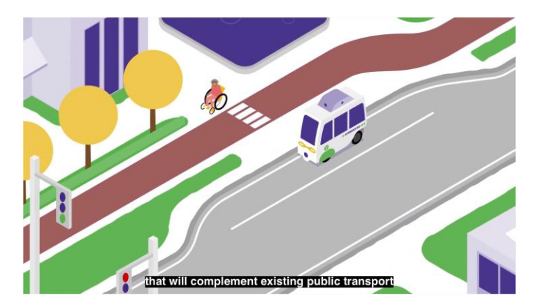
Figure 10: Shot showcasing centrality of the user