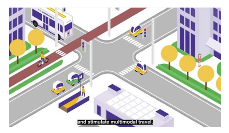
Figure 7: Shot showcasing the urban aspect of the project and multimodality