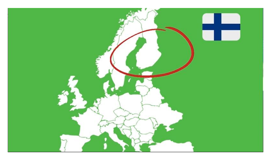
Figure 22: Interview with Tampere test site - Location of Tampere