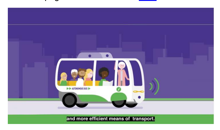
Figure 1: Shot showcasing an autonomous shuttle

Below it is possible to find the screenshots of some key scenes from the project video. The full animated video is publicly available on SHOW YouTube Channel <a href="here">here</a> and on the homepage of SHOW website <a href="here">here</a>.